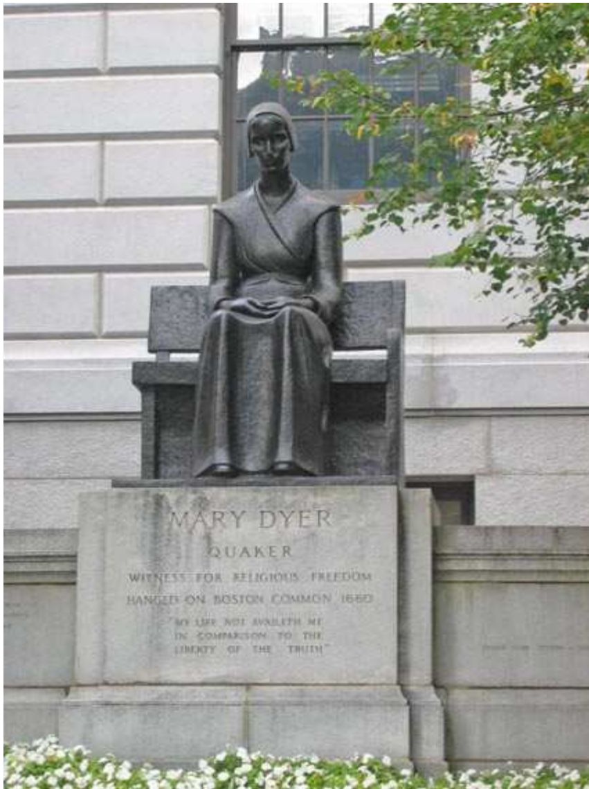
Boston Freedom Trail