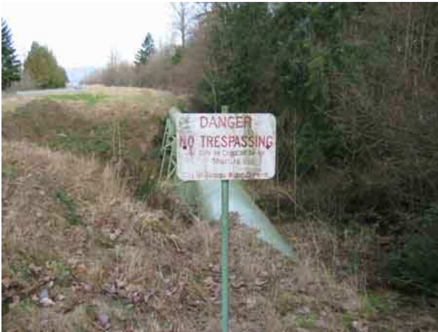
Danger lurks along the Trail of Tears