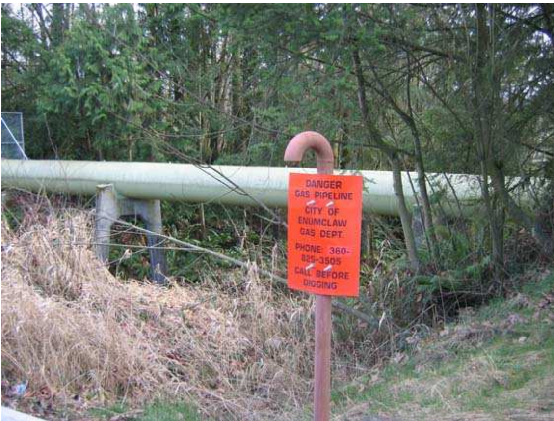
Gas lines, water aqueducts, gorges, private property, all add up to more tears of taking