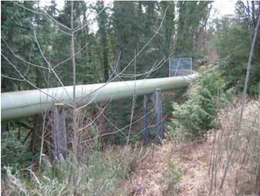
The trail of nonsense not common sense.